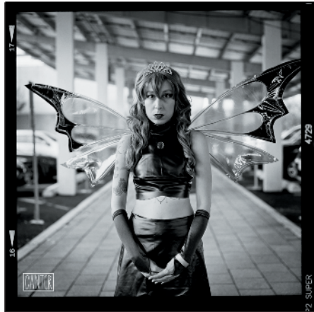
Butterfly Girl/Comic Fest