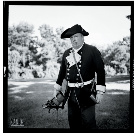
Naval Officer/Battle of Monmouth