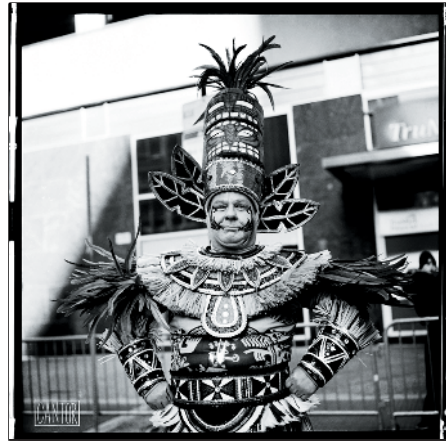
Smiling Mummer/Mummer Parade